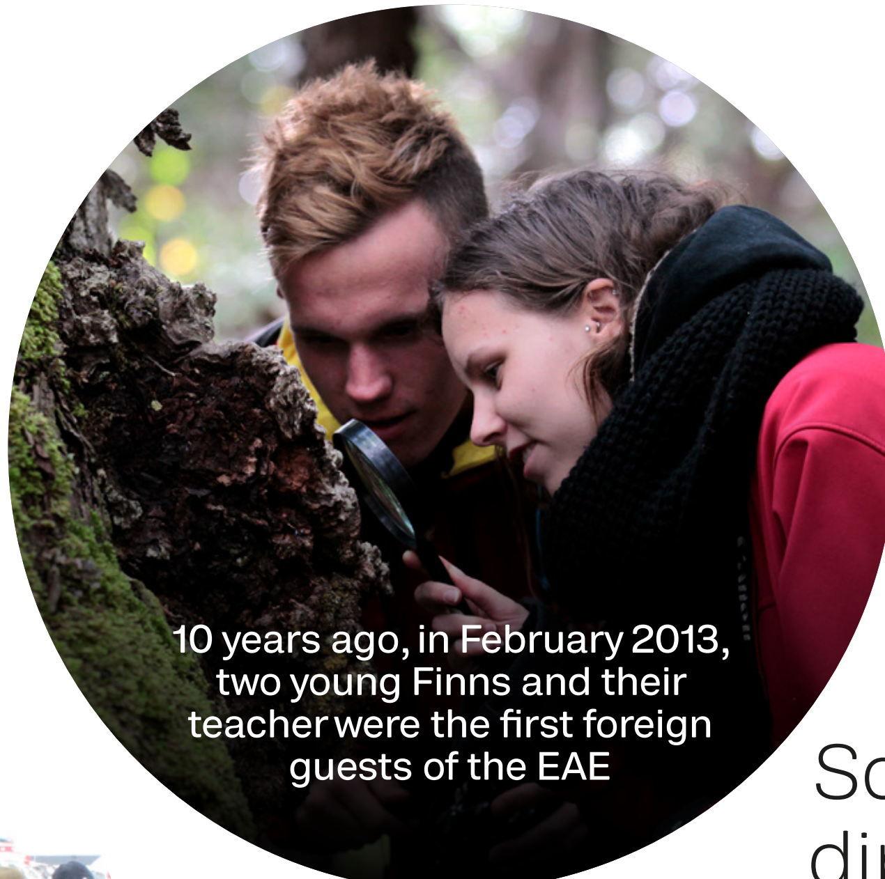
10 years ago, in February 2013, two young Finns and their teacher were the first foreign guests of the EAE