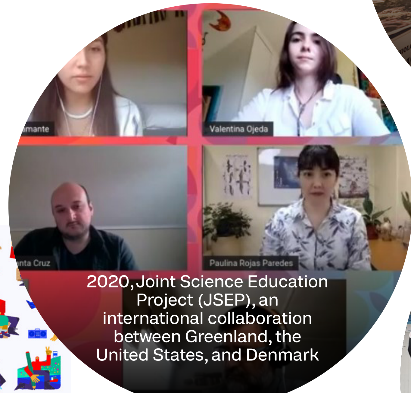
2020, Joint Science Education Project (JSEP), an international collaboration between Greenland, the United States, and Denmark