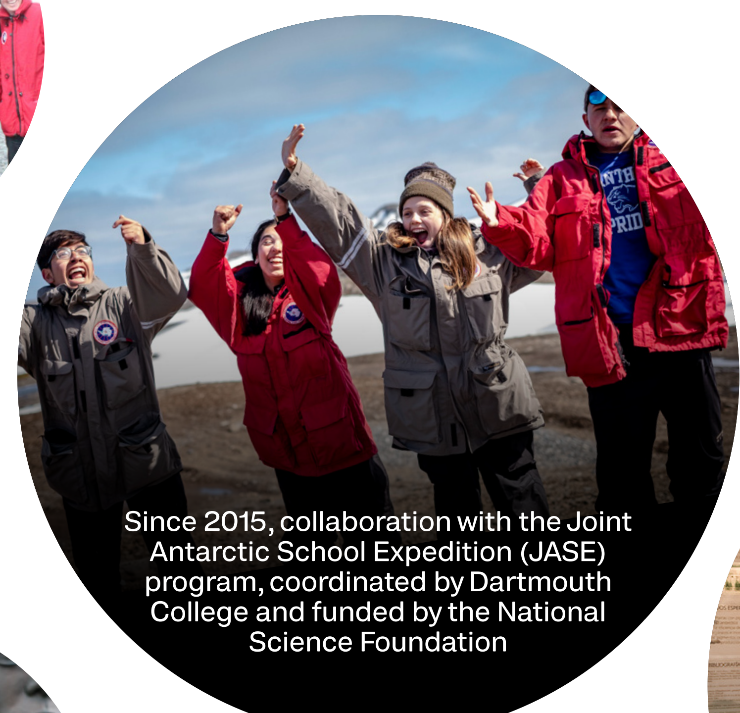
Since 2015, collaboration with the Joint Antarctic School Expedition (JASE) program, coordinated by Dartmouth College and funded by the National Science Foundation