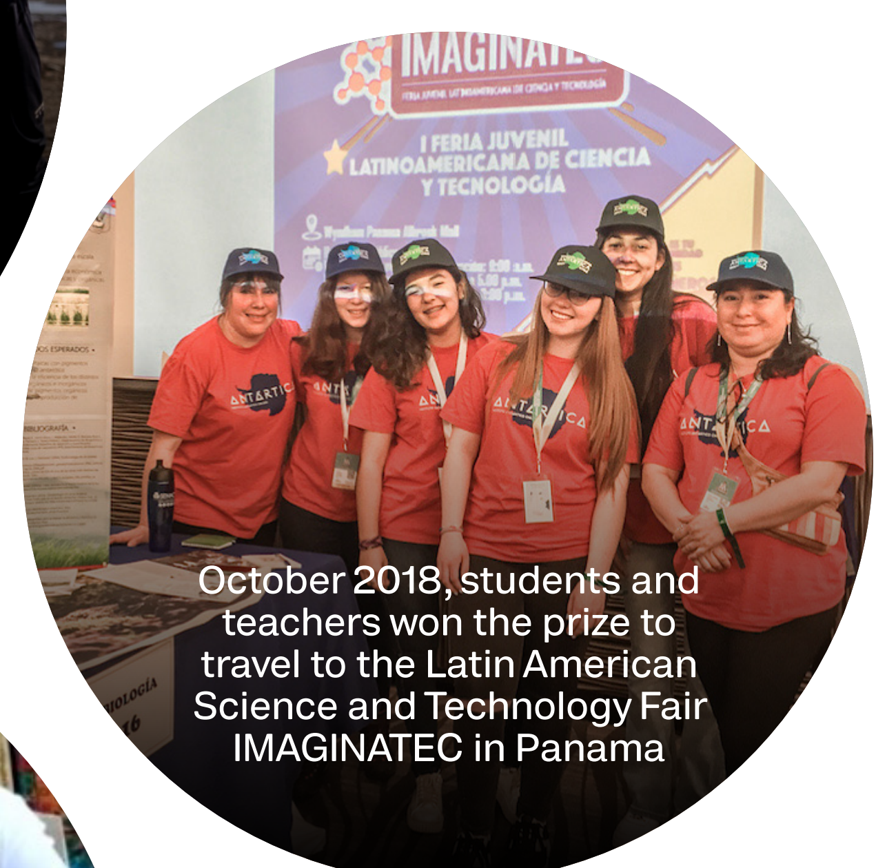
October 2018, students and teachers won the prize to travel to the Latin American Science and Technology Fair IMAGINATEC in Panama