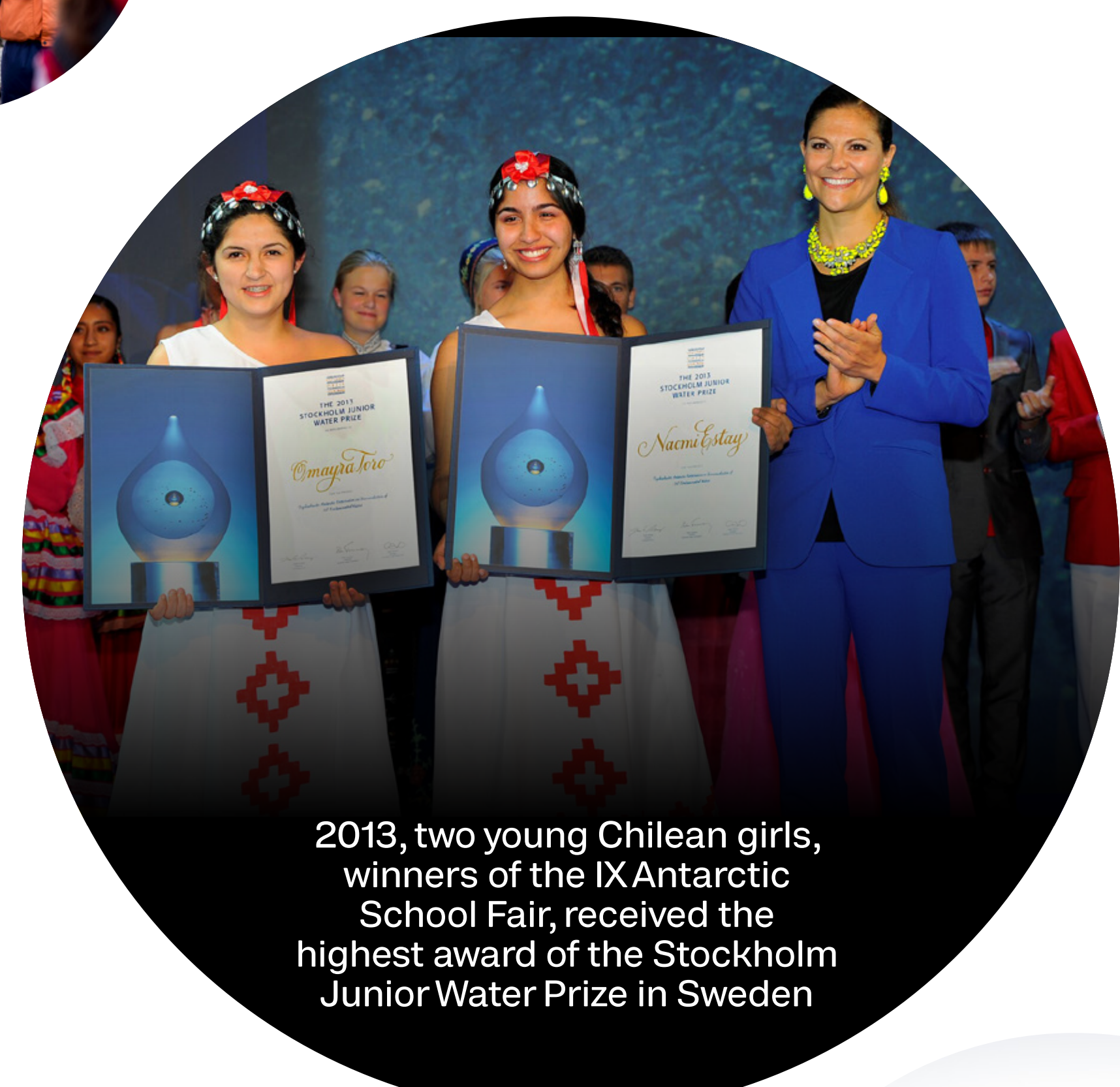
2013, two young Chilean girls, winners of the IX Antarctic School Fair, received the highest award of the Stockholm Junior Water Prize in Sweden