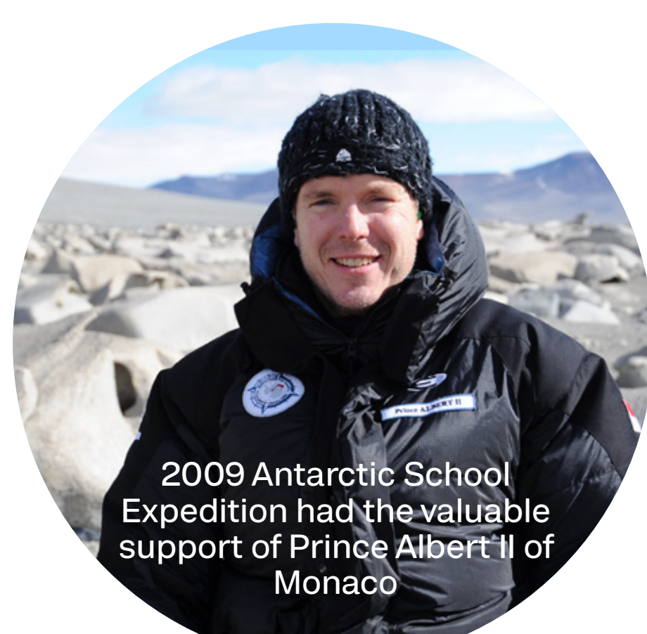
2009 Antarctic School Expedition had the valuable support of Prince Albert II of Monaco